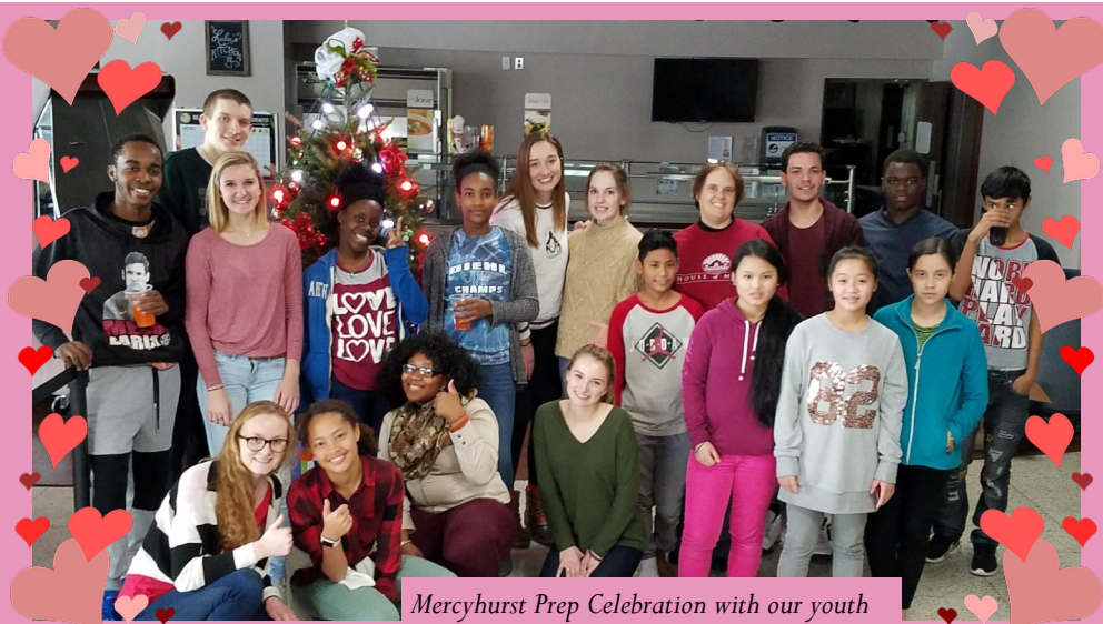
Mercyhurst Prep Celebration with our youth

Second Harvest Food Bank St. Luke's Parish Religious Education And ALL who donated their time, talent and treasure to make the season better for House of Mercy families.